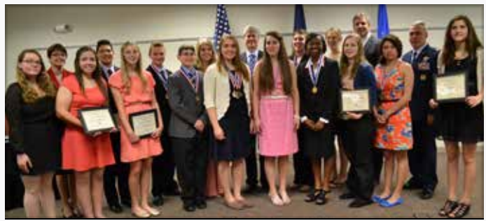
Representative Jeff Fortenberry (NE01)