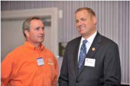
Congressman Jeff Duncan (SC03) and Congressman Jeff Denham (CA10) showing their support for fellow members of congress and chiefs of staff during the annual Congressional Award Poker Tournament.

The event also features a Silent Auction and reception for those who may not be inclined to show-off their poker skills but still want to take part in the event. Special guests have included poker pros and philanthropists Phil Ivey and Dennis Phillips.