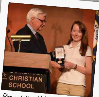
Representative Hal Rogers (KY05)