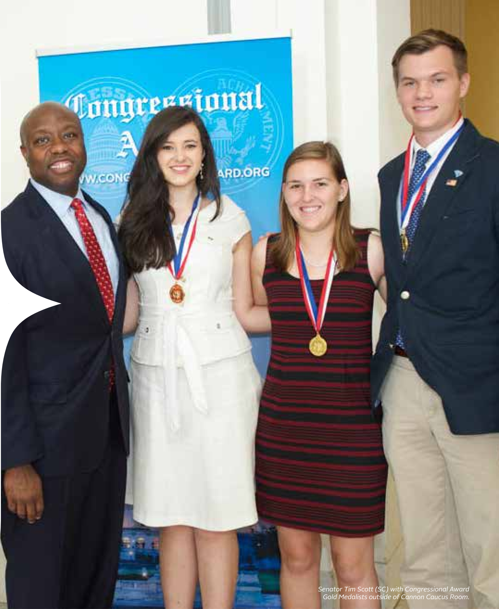
Senator Tim Scott (SC) with Congressional Award Gold Medalists outside of Cannon Caucus Room.