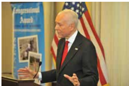
Senator Orrin Hatch (UT) addresses attendees at the Western State Dinner.