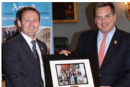
Representative Richard Hudson (NCo8) presents Representative Patrick Murphy (FL18) with a plaque recognizing his district for the most participants.