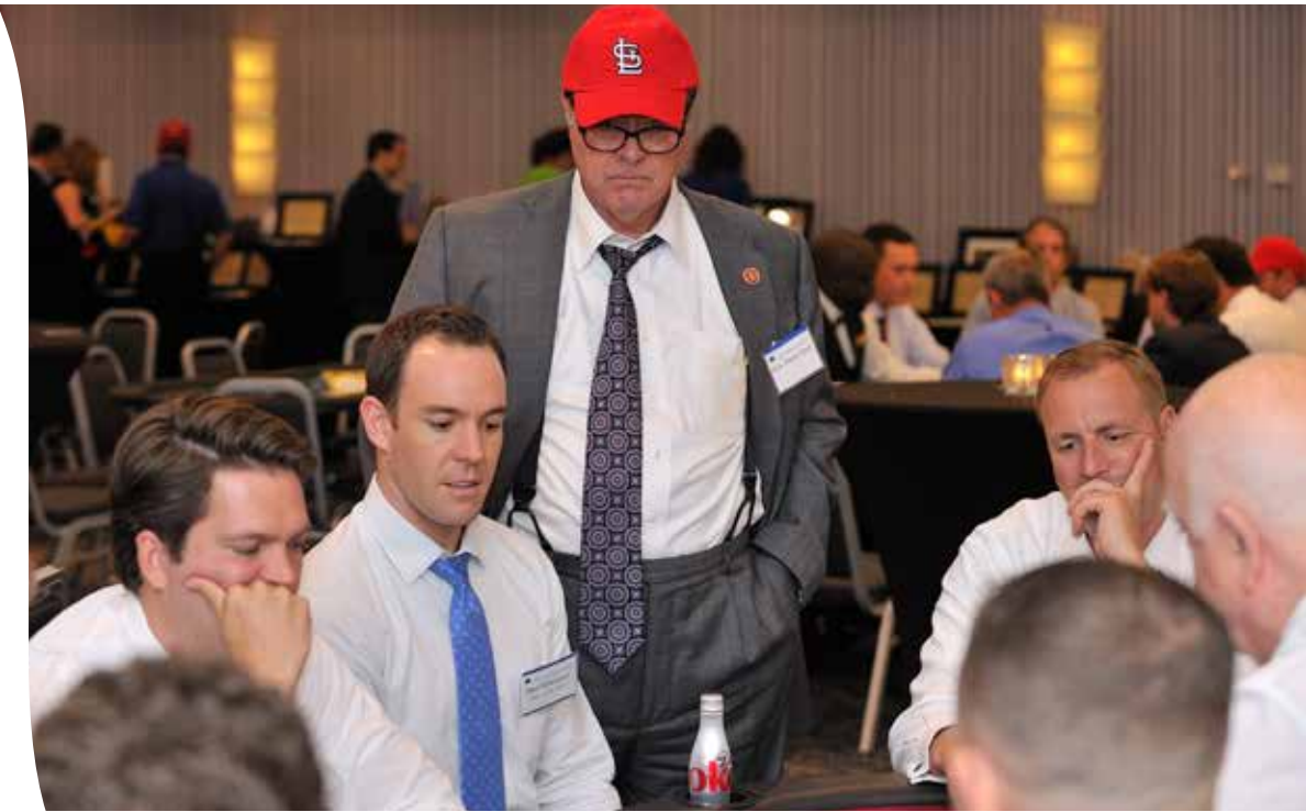
Tournament Co-Chair, Congressman Dennis Heck (WA10) watches play during the tournament.