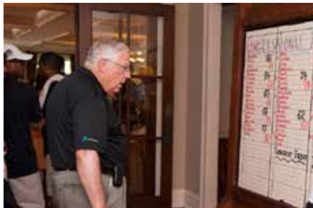
Honorary Co-Chair Senator Mike Enzi (WY) checks the final scores of his fellow golfers.

The Annual Congressional Award Golf Classic is held at the beautiful TPC Potomac Golf Course at Avenel Farm, in Potomac, Maryland. Recently redesigned by golf's most elite architects, the course is among those of the PGA Tour's acclaimed TPC Network of clubs. This event brings together current and former Members of Congress, as well as prominent guests such as NBA Hall of Famer Patrick Ewing, Alonzo Mourning, Dikembe Mutombo, Jeff Green, Chris Doleman, Emmitt Smith and Roger Clemens.