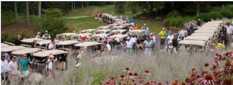
Golf carts lined up before the shotgun start