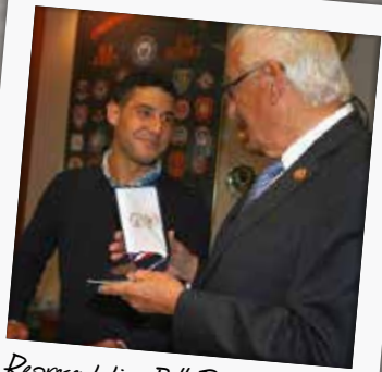
Representative Bill Pascrell (NJ09)