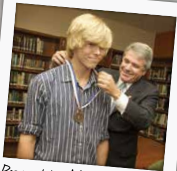
Representative Michael McCaul (TX10)