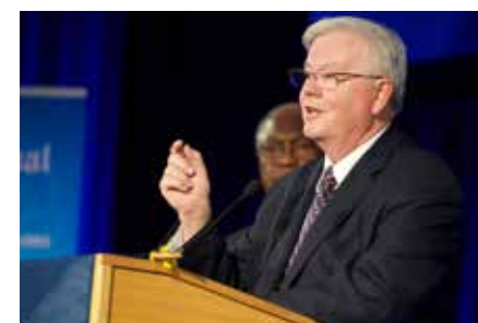
Representative Joe Barton (TX06) speaks about civic engagement.