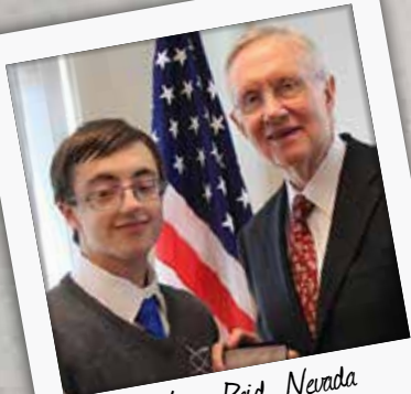
Senator Harry Reid, Nevada