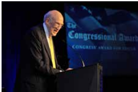
Former Senator Alan Simpson (WY) receives the Leadership Award for his continued support of the program.

The Congressional Award Foundation hosts an annual dinner with members of the Senate HELP and House Energy and Commerce Committees in Washington, DC. Formerly hosted by the late Senator Ted Kennedy, this annual event provides an opportunity for Republicans and Democrats alike to come together in celebration of their only charitable foundation. Specifically, this dinner advocates the importance of civic engagement and physical health and fitness for youth – two of the main components of the Congressional Award program.