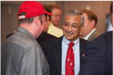
Representative Bobby Scott (VA03) mingles during the tournament.