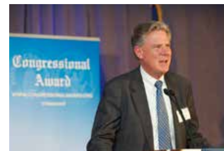
Representative Frank Pallone (NJ06) addresses the crowd.

"I would encourage young people to pursue the Congressional Award as it will be a learning experience for them, and allow them to advance as individuals who can both succeed and give back to their communities."