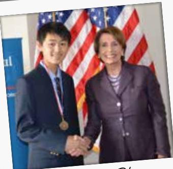
Representative Nancy Pelosi (CA12)