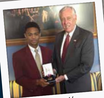
Representative Steny Hoyer (MD05)