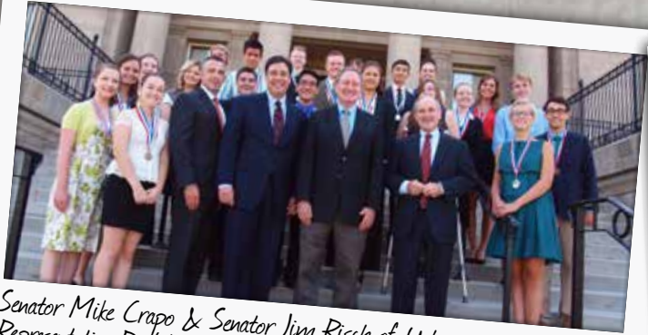
Senator Mike Crapo & Senator Jim Risch of Idaho with Representative Raul Labrador (ID01)