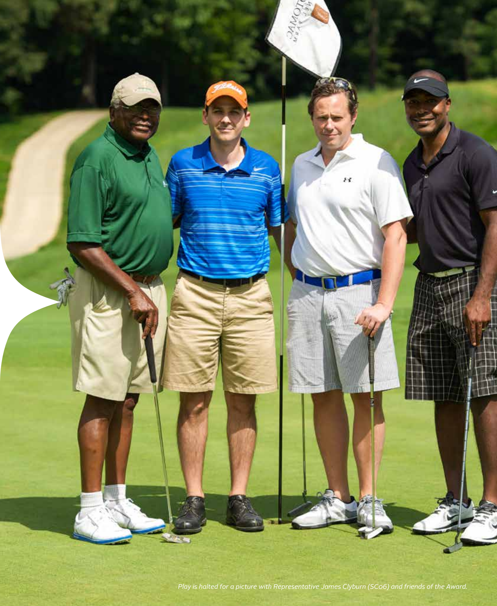
Play is halted for a picture with Representative James Clyburn (SC06) and friends of the Award.