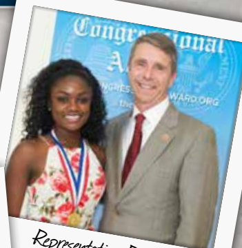
Representative Rob Whittman (VA01)