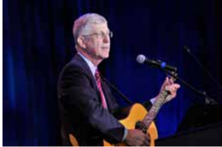
Director of NIH Dr. Francis Collins performs an original song in honor of Congressional Award Medalists after receiving the 2013 Howard Wallop Leadership Award.