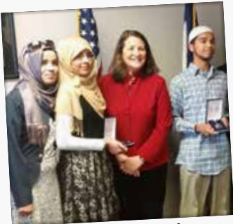
Representative Diana DeGette (CO01)