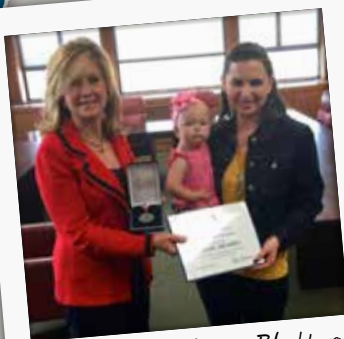
Representative Marsha Blackburn (TN07)